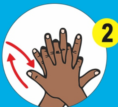
PALM OVER BACK