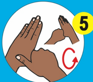
BASE OF THUMBS